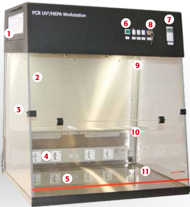
PCR UV 3 HEPA Cabinet & Workstation